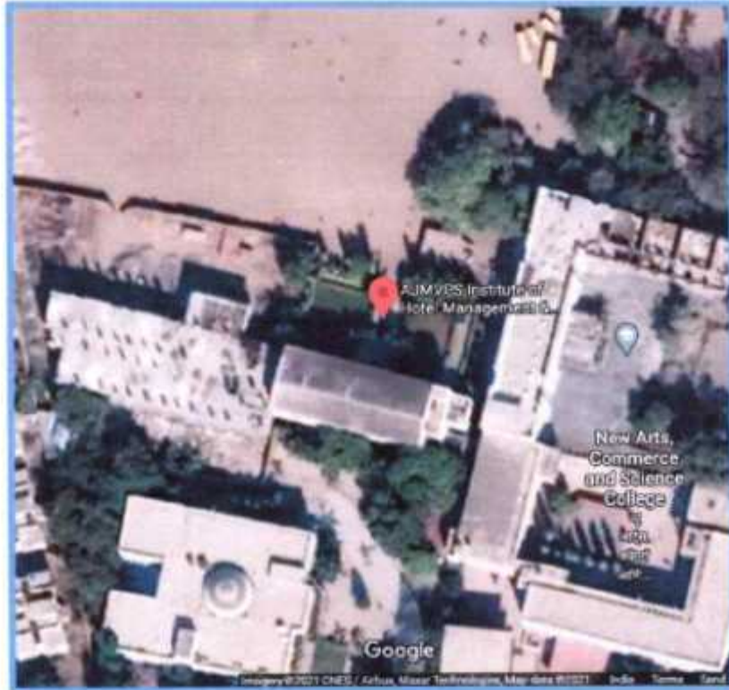
SATELITE VIEW OF A.J.M.V.P.S Institute of Hotel Management and Catering Technology, Ahmednagar