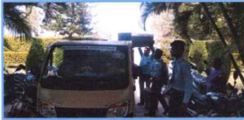
Solid Waste sent to MNC waste collection