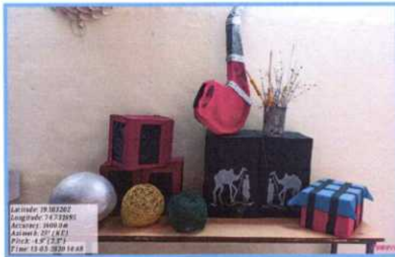
Solid Waste reused to make decorative articles used for Food Festival of the college