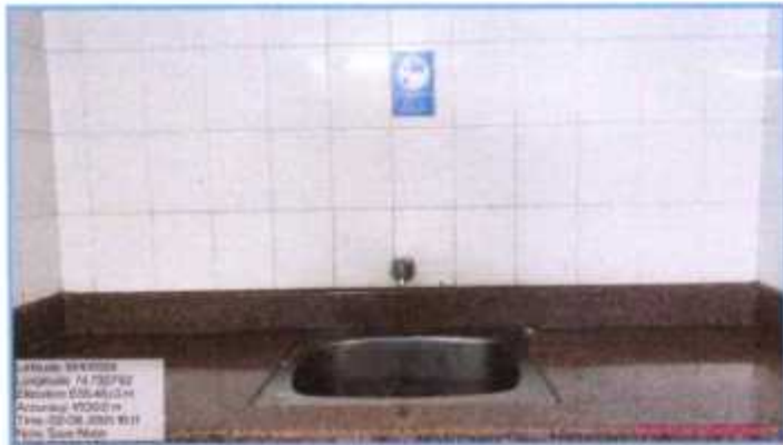
Sign Water and RO treatment of water