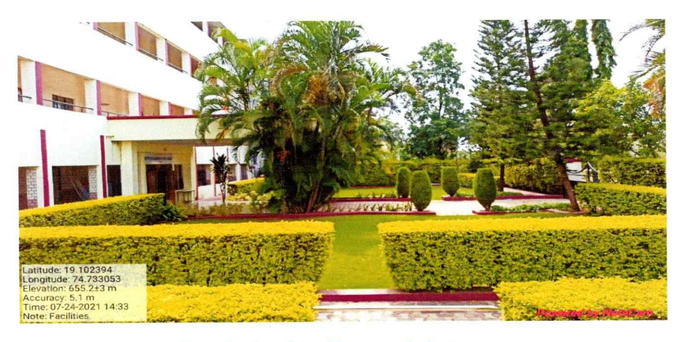
Green landscaping with trees and plants

Approved by AICTE, Govt. of Maharashtra, DTE & Affiliated to Uni. of Pune