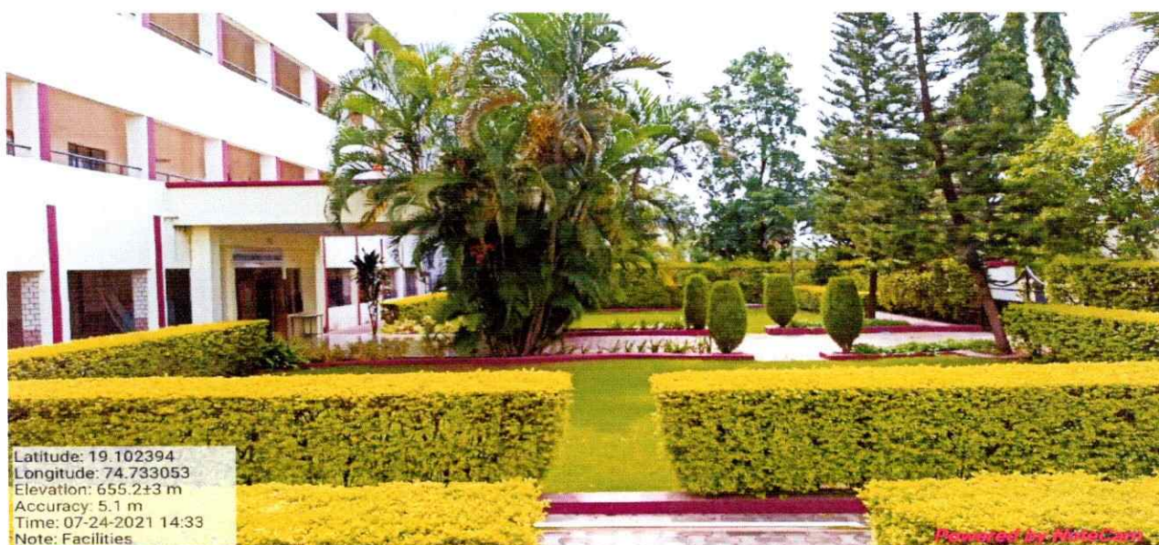
Green landscaping with trees and plants

Approved by AICTE, Govt. of Maharashtra, DTE & Affiliated to Uni. of Pune